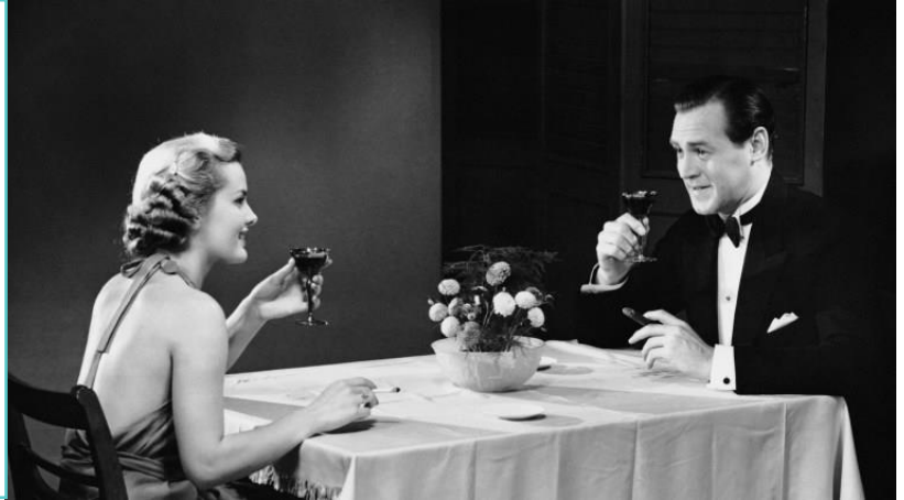
Image: In the 1950s, smoking was portrayed as glamorous.

By the 1950s around half of the population of industrialized countries smoked, and in countries such as the United Kingdom, up to 80 percent of adult men were regular smokers!