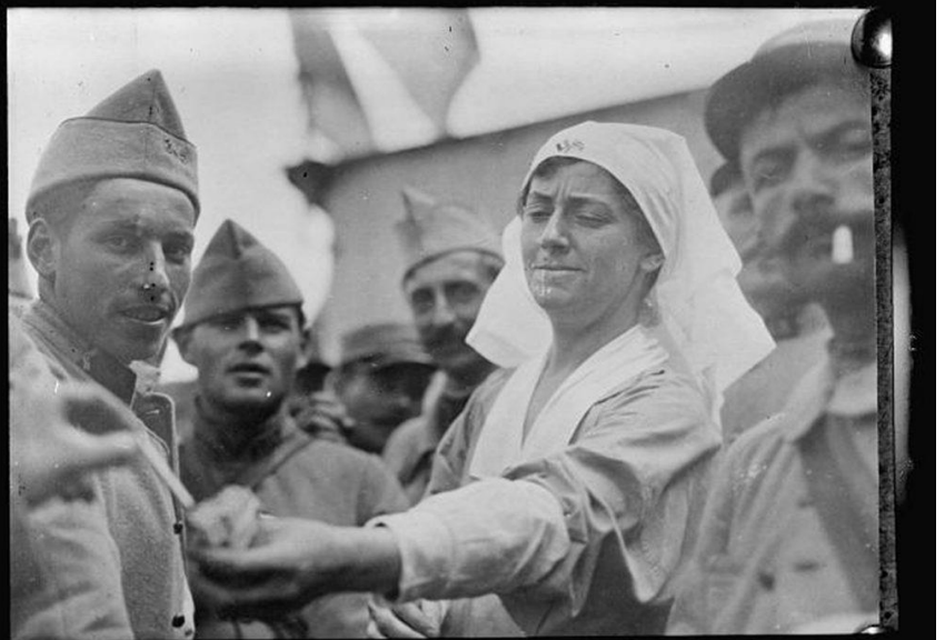
Image: American Red Cross worker distributing cigarettes to soldiers at the A.R.C. Canteen at Orry la Ville

'The nurses are very good to you. They fetch cigarettes and matches to you.'